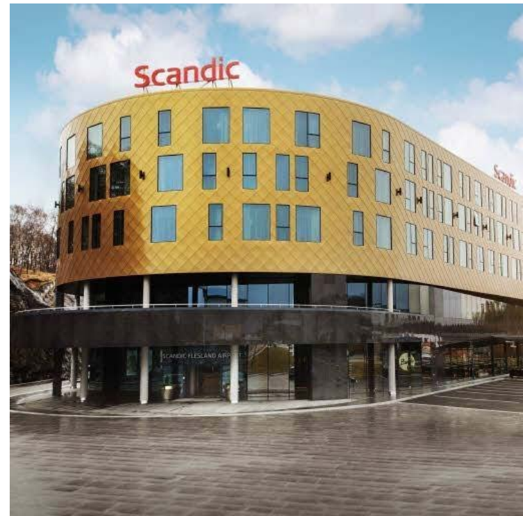
Scandic Flesland Airport Hotel